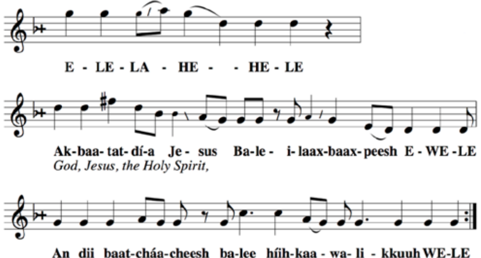
An dii baat-chaa-cheesh ba-lee hiih-kaa - wa-li - kkuuh WE-L Your power, let it come to us.